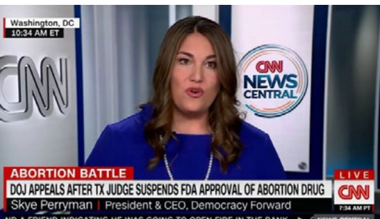
Democracy Forward represents the generic manufacturer of mifepristone in its efforts to keep the medication accessible and on the market.

Making Government More Effective: Until today, the federal regulatory process has been hamstrung and outdated, and federal rulemaking is often not as equitable or responsive to needs of communities across the country as it could be. To address this, we formed and led a steering committee of national organizations to support plans proposed by the Office of Informational and Regulatory Affairs (OIRA) to modernize federal regulatory review so that policies are implemented in ways that better serve people. We educated more than 100 organizations about the importance of regulatory modernization, garnered support of nearly 150 organizations, trained nearly 20 organizations on how to engage, and facilitated more than 30 organizations in supporting a separate letter to ensure that underserved communities have more meaningful access to the federal regulatory process. We are pleased that OIRA has made important updates to our regulatory process.