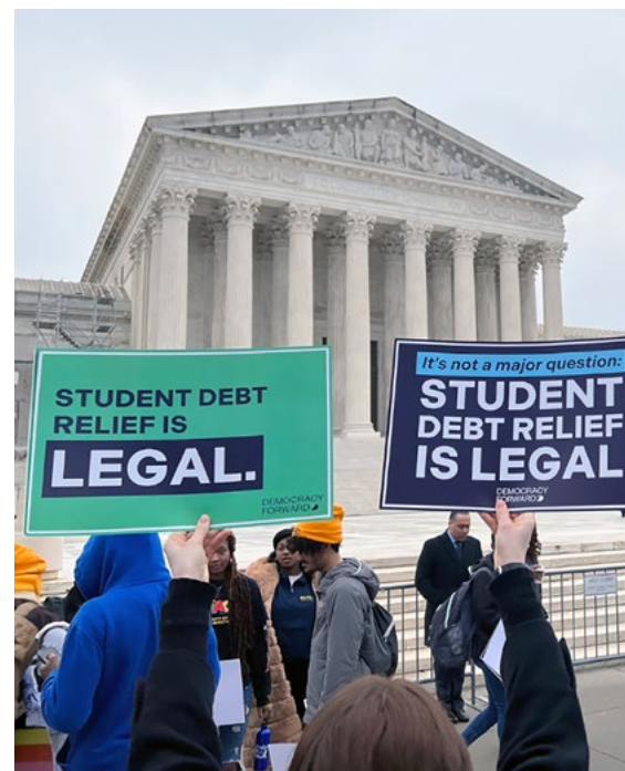
Democracy Forward represented a coalition of leading legal scholars in defending the legality of the President's student loan relief program.

Promoting the Separation of Church and State: On its way out, the Trump administration finalized a regulation that expressly authorized federal contractors to discriminate on the basis of sex, sexual orientation, or gender identity by citing religious objections. With a coalition of tradeswomen, teachers, workers' advocates, and civil rights organizations, we fought back in court. Now, the US Department of Labor's (DOL) Office of Federal Contract Compliance Programs (OFCCP) officially rescinded the rule. This rescission from the DOL's OFCCP is a victory for the rule of law, workers across the country, and religious freedom.