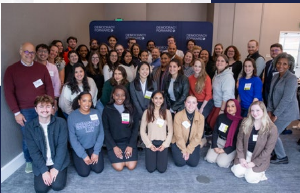
Democracy Forward staff gather for its fourth quarter staff retreat in Washington DC