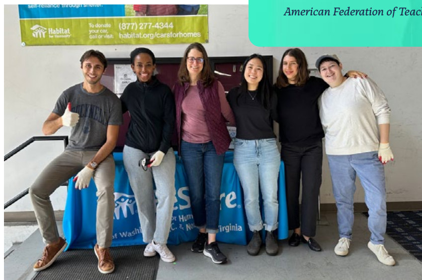
Democracy Forward staff takes time away from the courtroom to connect with each other through volunteering at a Habitat for Humanity service project.