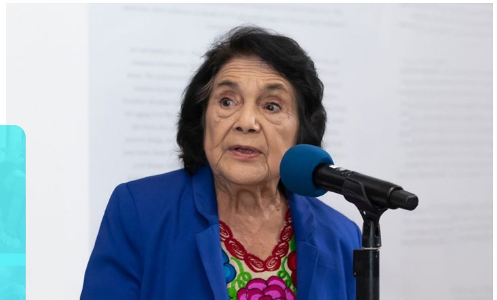
Presidential Medal of Honor Winner and legendary civil rights activist Dolores Huerta speaks to Democracy Forward supporters at the National Museum of American History.

Democracy Forward community for a showing of of the exhibit “A More Perfect Union: American Artists and the Currents of Our Time,” which features diverse and moving depictions of the American experience and demonstrates the essential and symbiotic relationship between democracy and artistic expression. We were joined by 93-year-old Presidential Medal of Honor Winner and legendary civil rights activist, Dolores Huerta, who spoke about the power everyday people can play in achieving democracy in this time.