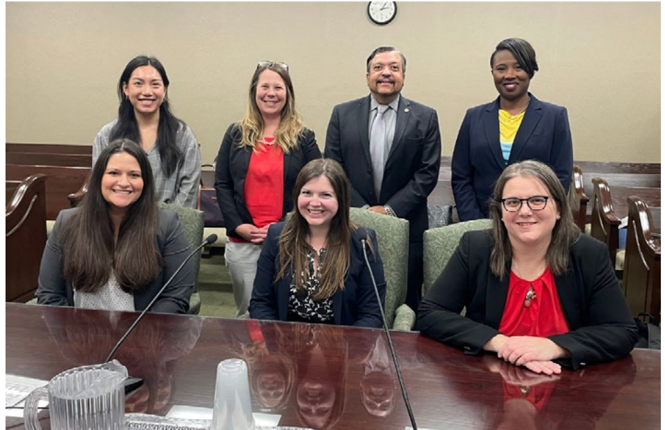
Democracy Forward staff members, along with local co-counsel in Florida, in the courtroom ahead of oral arguments in our legal challenge over the state's censorship laws.

challenging the misappropriation of public funds to private schools and have won a court order for parents.