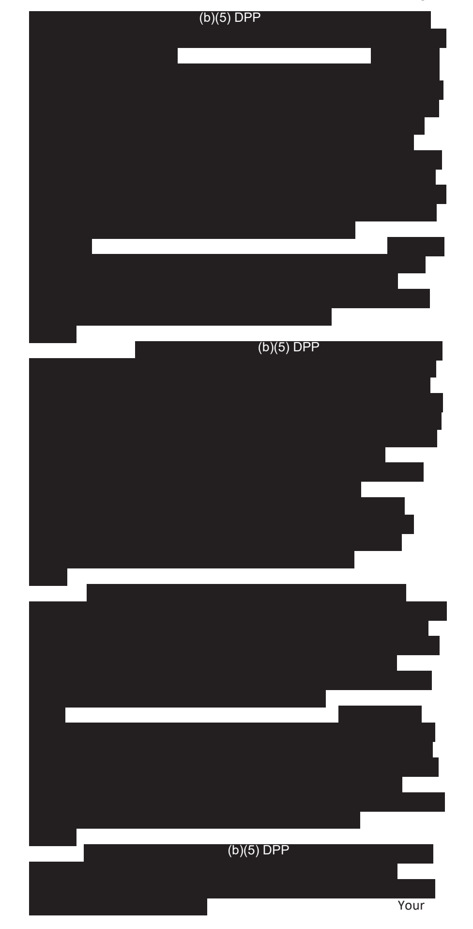
Case 1:18-cv-00246-DLF Document 31-2 Filed 12/18/19 Page 26 of 64